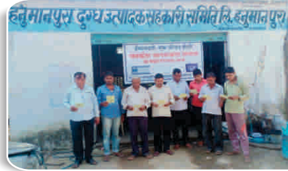
दुग्ध उत्पादक सहकारी समिति लि. हनुमानपुर