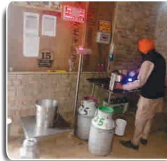
Milk Collection operations at a Society in Punjab