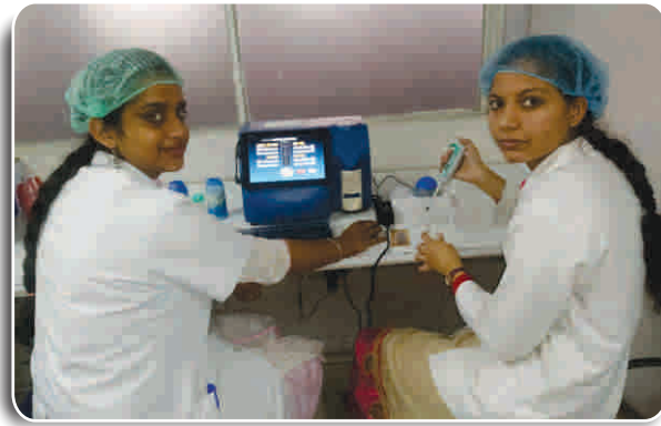
Installation of Somatic Cell Counter at Verka Milk Union Punjab