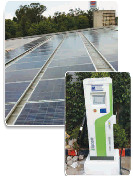
DC fast Charger powered by Solar of 30 KW capacity at Rajasthan Rajpath Service Station, NH-08, Gurugram

A total of 9.81 Lakh PUC certificates have been generated through online CPUCC in this quarter taking the total generation to 71.10 Lakh since beginning.