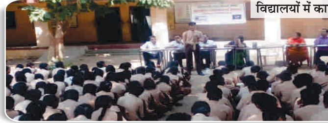
विद्यालयों में कार्यक्रम की तर्ज पर प्रतियोगिताएं