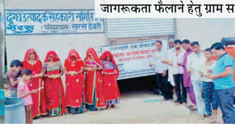
दुग्ध उत्पादक सहकारी समिति लि. हनुमानपुर