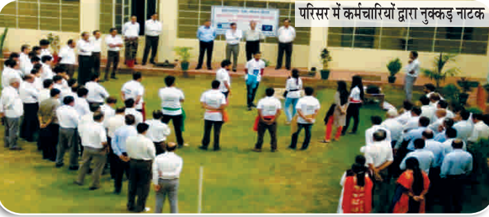
परिसर में कर्मचारियों द्वारा नुक्कड़ नाटक