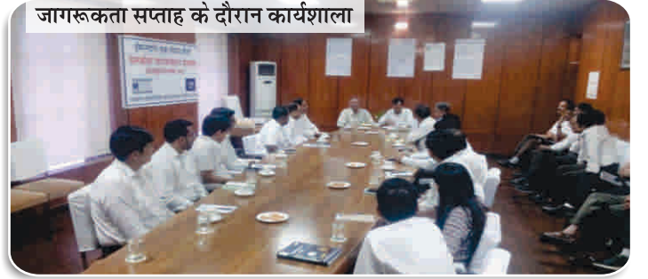
जागरूकता सप्ताह के दौरान कार्यशाला