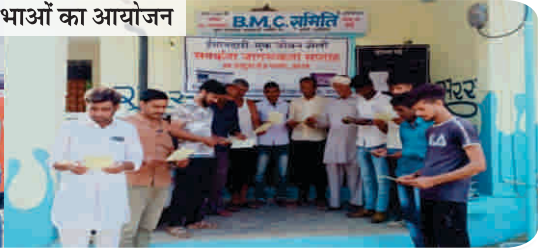
जागरूकता फैलाने हेतु ग्राम सभाओं का आयोजन