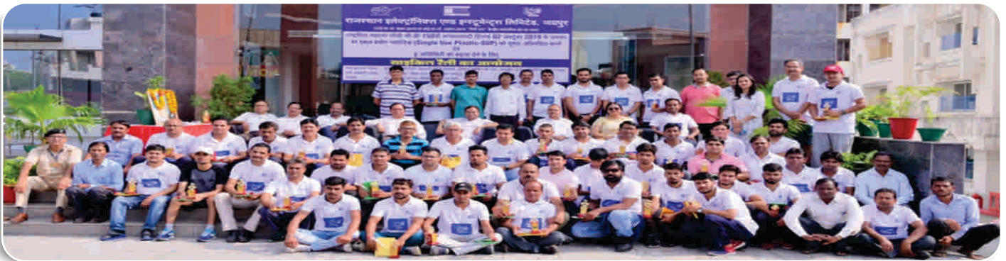
Team REIL on occasion of celebration of 150 th Birth Anniversary of Mahatma Gandhi