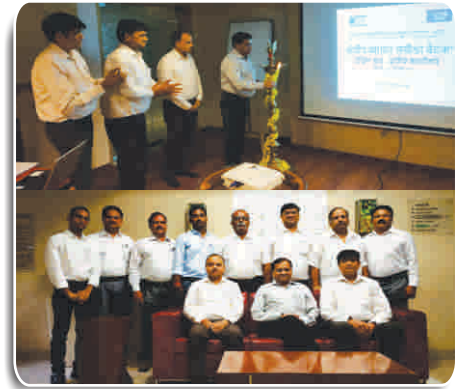
Glimpse of the Strategy Meet on 16.11.2019