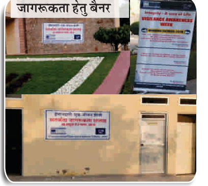
जागरूकता हेतु बैनर