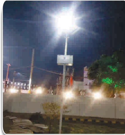
SPV LED SLS installed at Gurudwara in Kapoorthala (Punjab) under PSU CSR

Under PSU Synergy, regular work is being done and SPV Power Plants at 15 Government schools & SPV Street Lights will be deployed in Rajasthan.