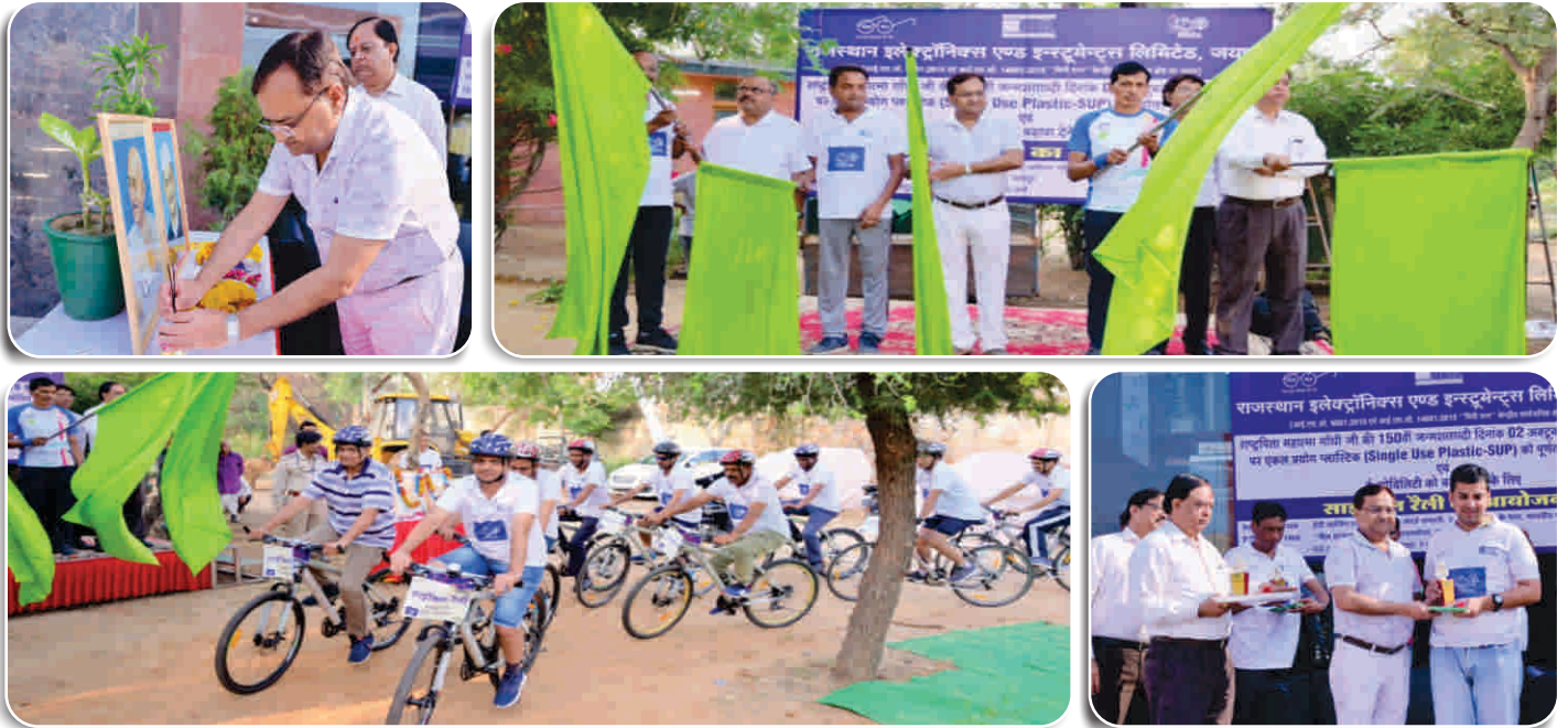
Glimpse of activities undertaken at REIL during Mahatma Gandhi's 150 th Birth Anniversary