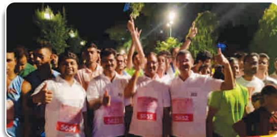
Participants from REIL