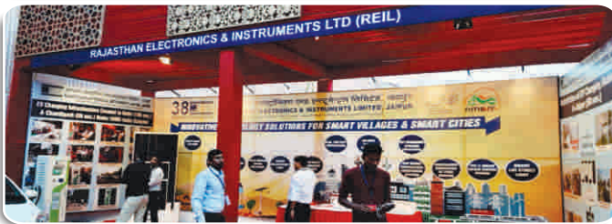
REIL's stall at City Palace, Jaipur